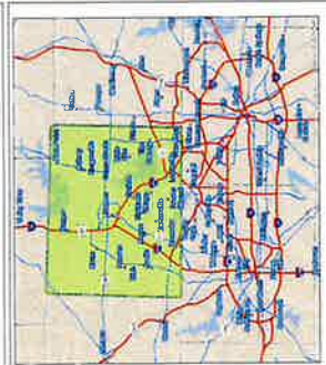
Relationship to the Region